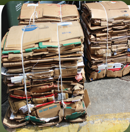
Average 3-4 bales per week recycled

Their environmental stewardship reflects a deep respect for Hawai'i's natural beauty and a responsibility to preserve it for future generations while delivering the exceptional experience members expect and deserve.