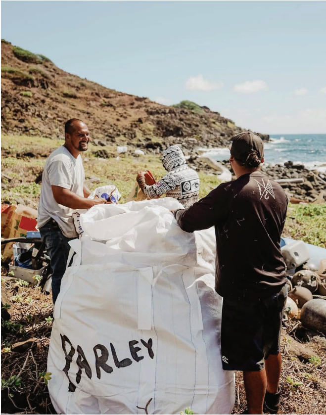
Encouraging sustainability practices