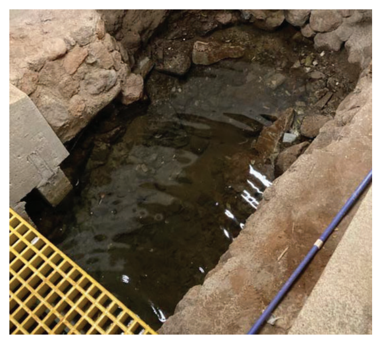
Natural Well Water