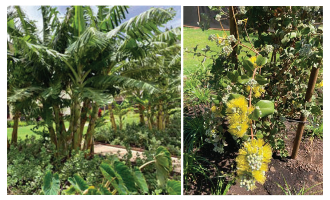
Landscape: Taro, Banana, Breadfruit