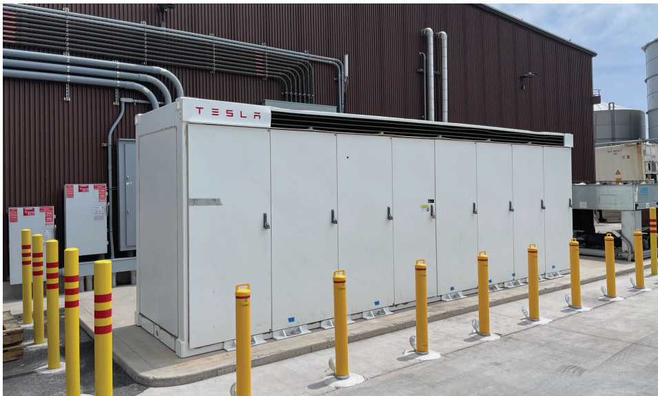
Storage for solar panels