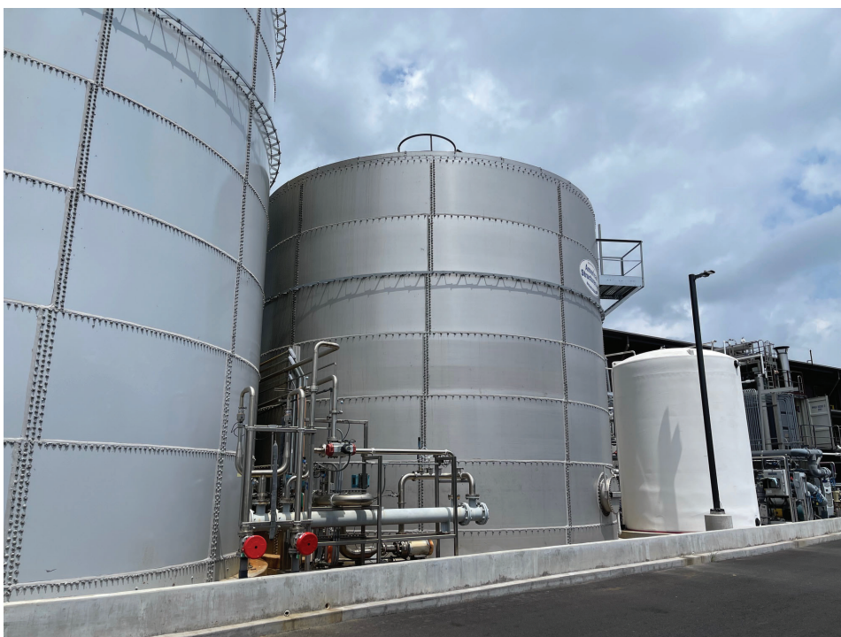
Water and treatment reclaim