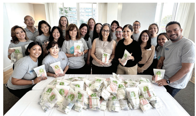
Clean the World