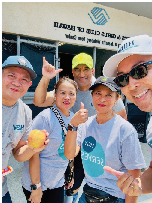
Boys and Girls Club of Hawaii