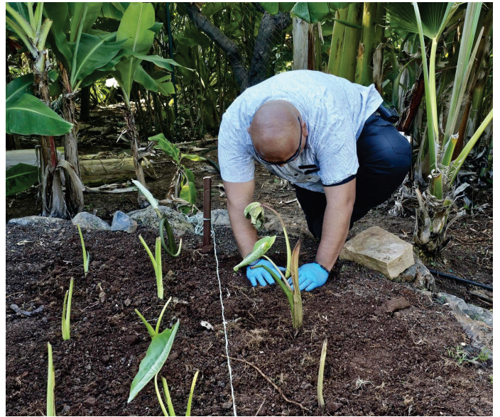
Staff Earth Day 2025 kalo planting