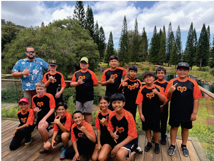
Maui Police Department Youth Academy June 10, 2024 (lunch donations)