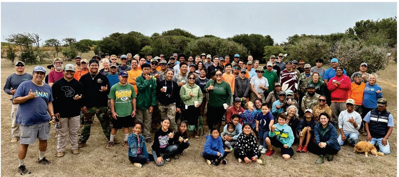
Kānepu'u Dryland Forest Volunteer event by Lāna'i Culture & Heritage Center, August 24, 2024