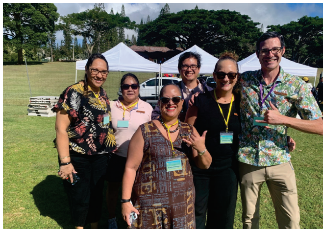
Lānaʻi High and Elementary School (LHES) 2024 Career Fair