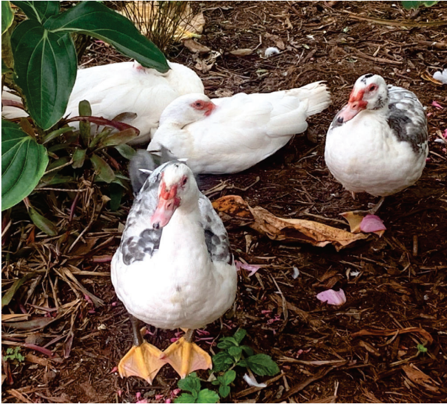
Muscovy ducks sustainable pest control