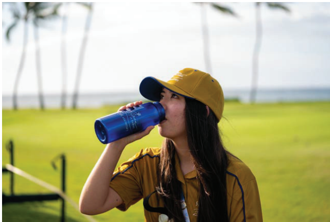
Volunteer with a reusable water bottle.