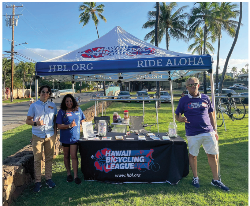
Hawai'i Bicycling League Bike Valet