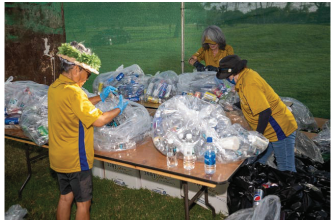
Hand sorting of recycling waste stream.