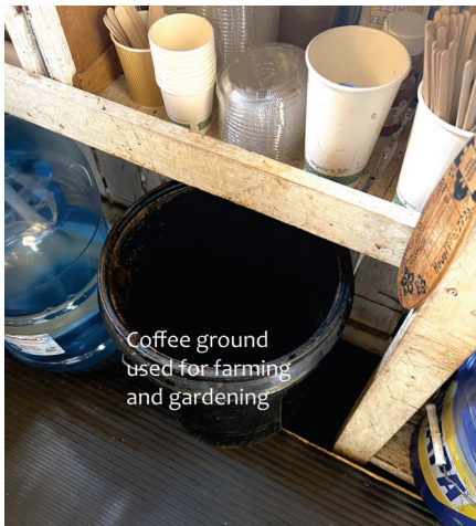
Coffee ground used for farming and gardening