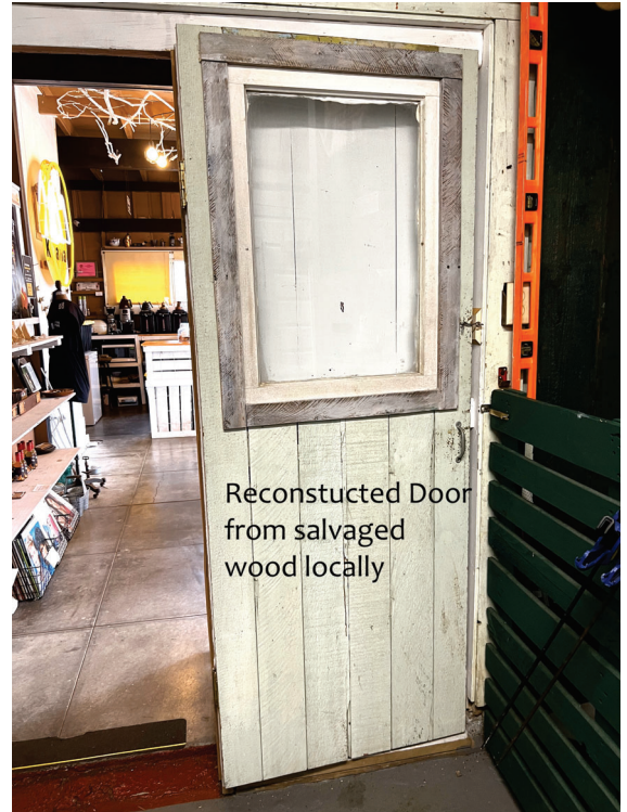
Reconstructed Door from salvaged wood locally