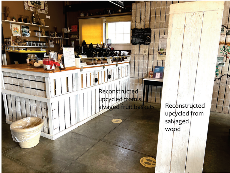
Reconstructed upcycled from salvaged fruit baskets