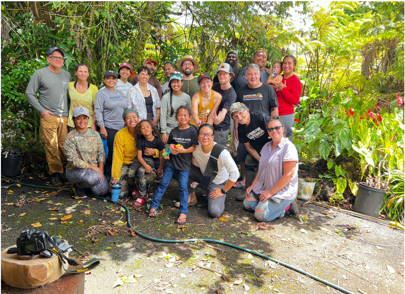
Koana Cultural Community volunteers