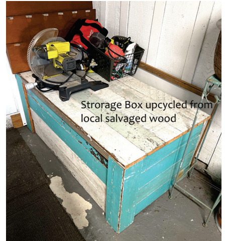
Storage Box upcycled from local salvaged wood