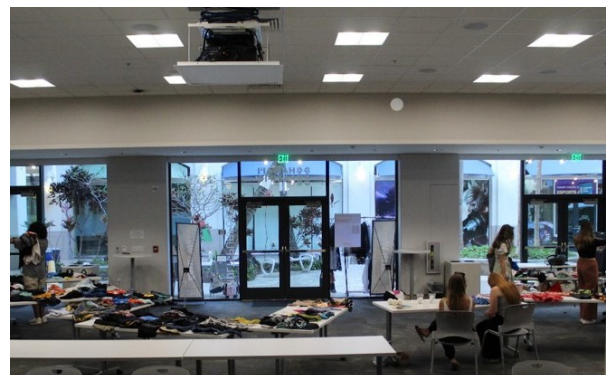
Event #2 - Thrift & donate