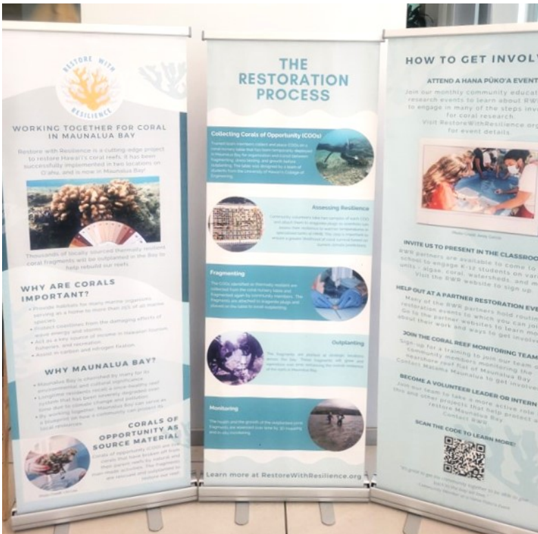
Mālama Maunaloa (educational/career opportunities)