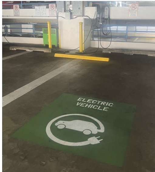
Charging infrastructure for electric vehicles and E-bikes