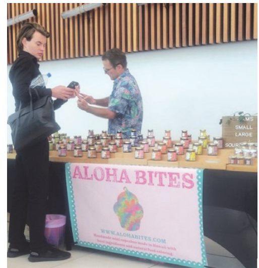
Locally sourced products provided by Aloha Bites