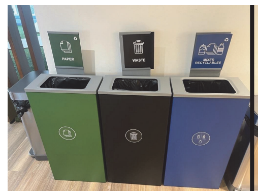
Clearly sorted waste and recycling provided