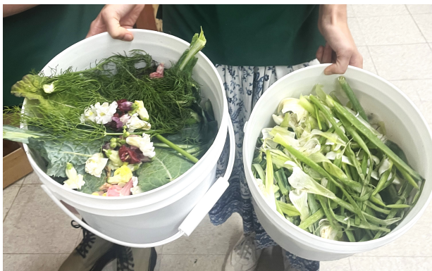
Composting (above) & compostable bags (below)