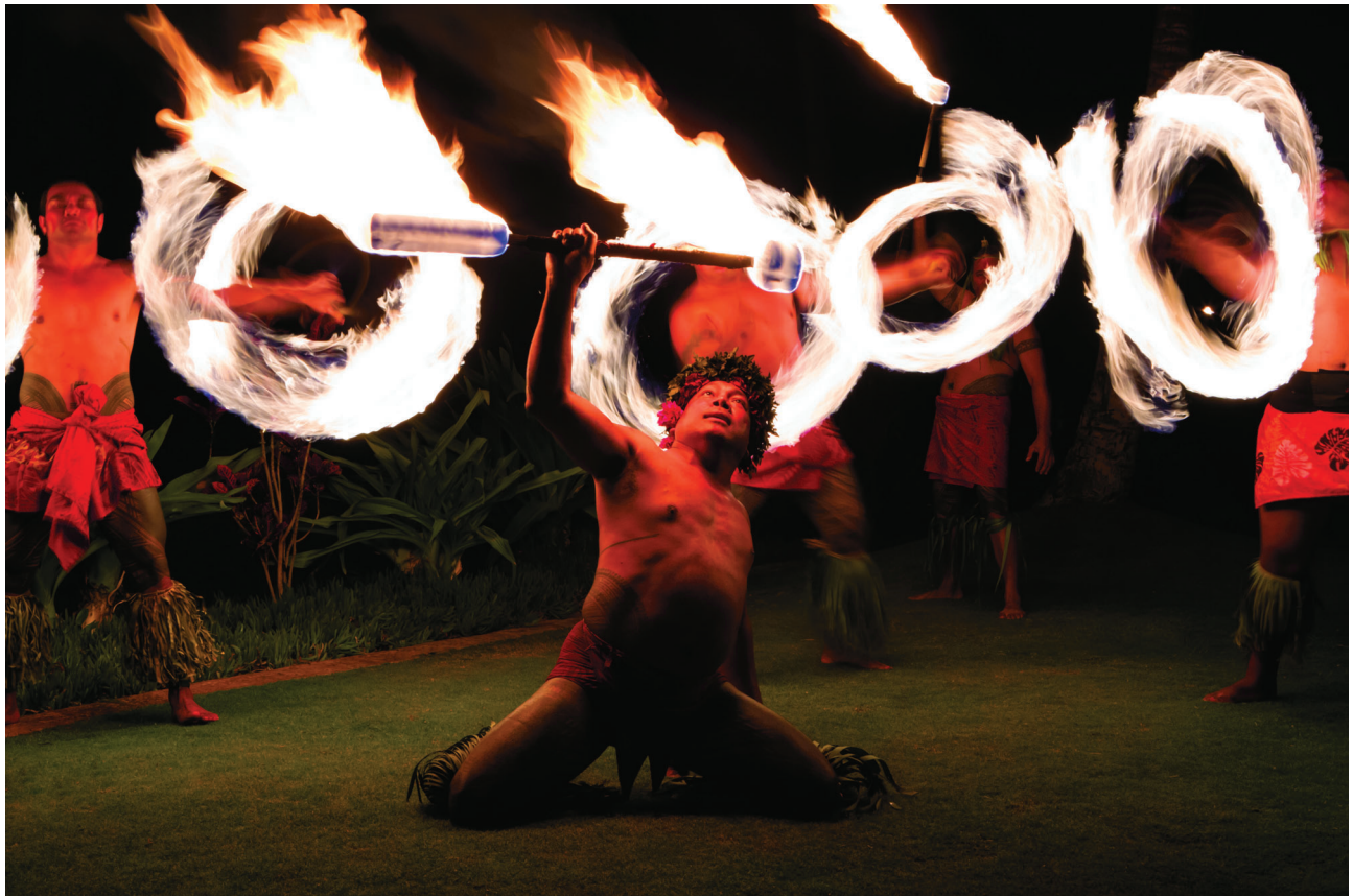
The Samoan-based Fia Fia Luau features Fire Knife Dancing, Hula Dance, and a Hawaiian Feast every Tuesday—taking guests on the journey through the South Pacific. With no show the same, it is always a good look at Polynesian culture.