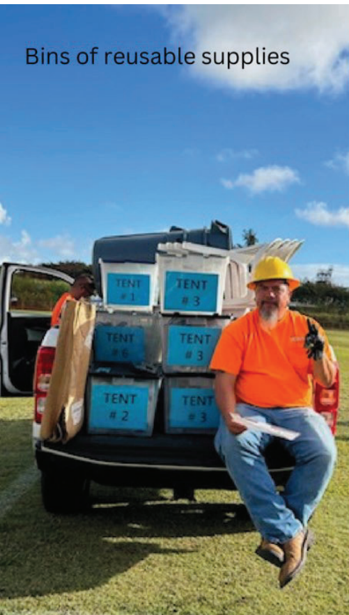
Bins of reusable supplies