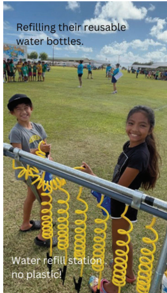
Refilling their reusable water bottles.