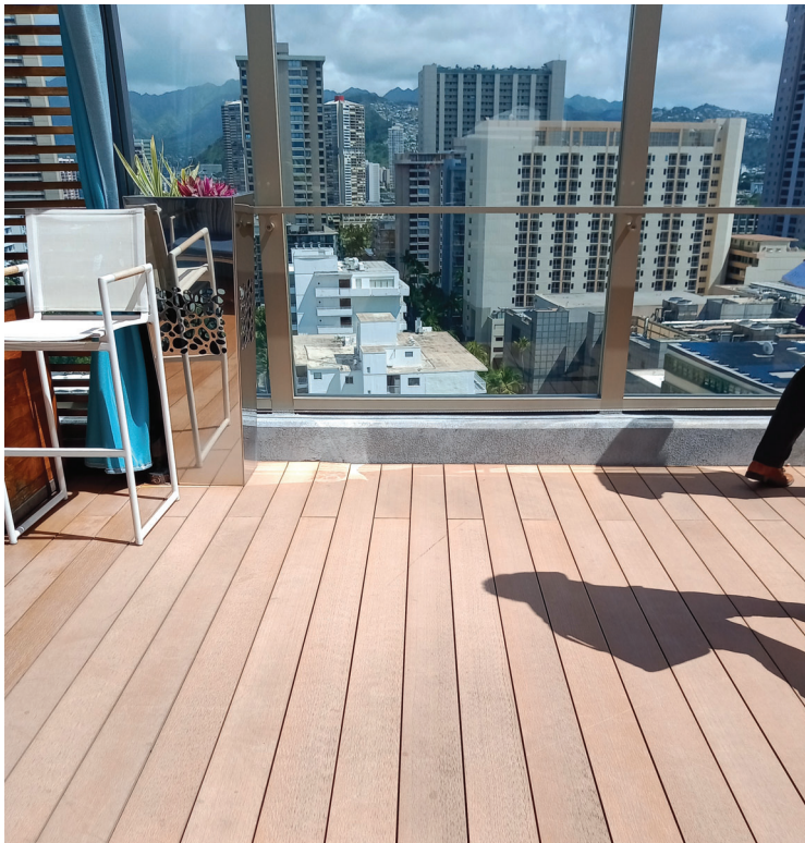
Pool deck is rice husk composite