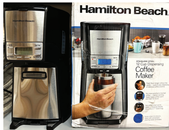
Mesh filtered coffee brewers