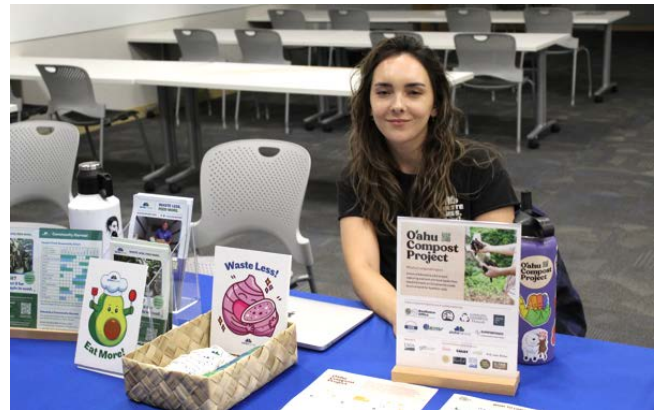
The digital flyers, decorations, chairs, tables, and the rooms were reused for every event.