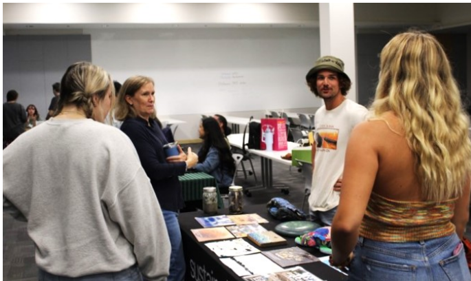
Event #5 - Food waste workshop