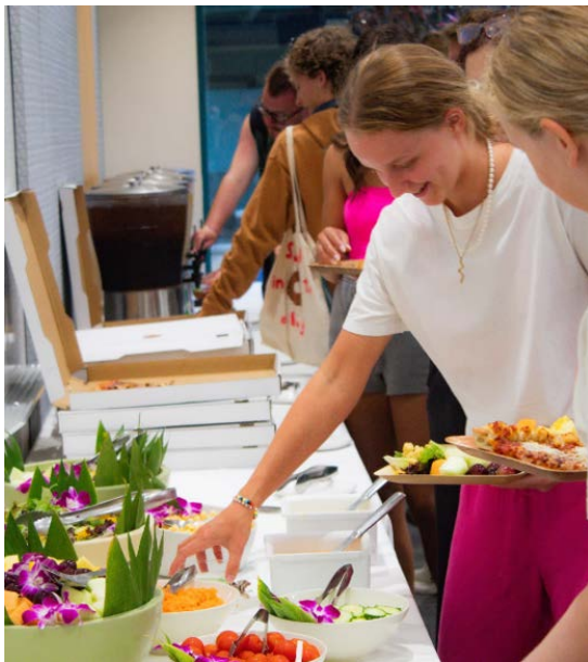
Food served was edible by hand and Pier 9 provided reusable tableware.