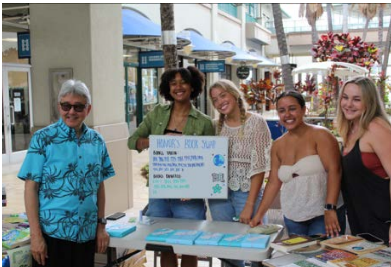
Event #1 - Book swap