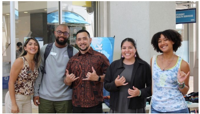
Event #4 - T-shirt to tote