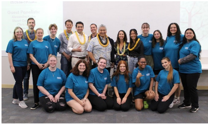
Event #3 - Movie night