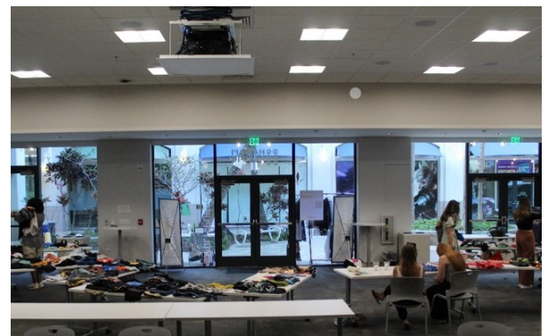
Event #2 - Thrift & donate