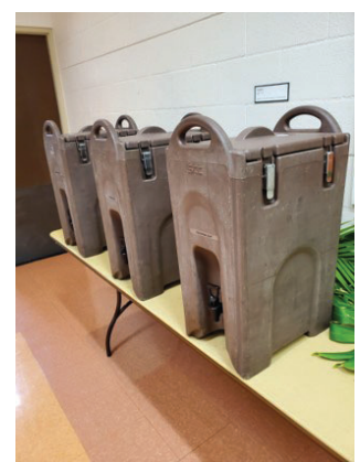
Catering was buffet style, featuring vegetarian/vegan options, and finger foods that are not individually wrapped and do not require utensils. Cups and tableware were reusable or compostable.