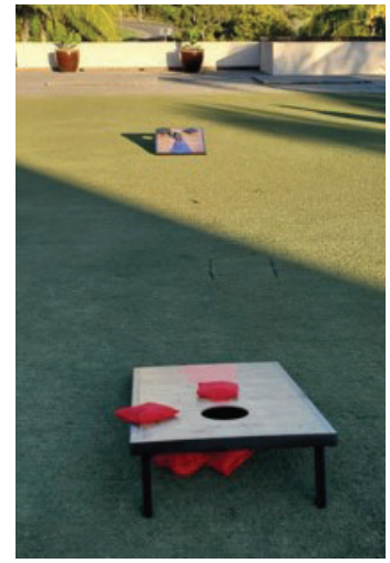
For waste reduction, reused items from other events and foliage from event planner's yard.