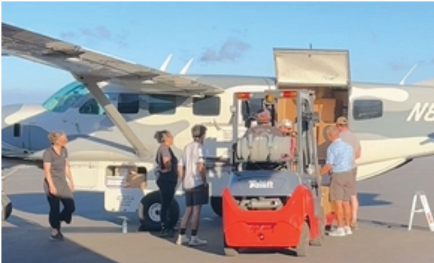
Lahaina Wildfire Relief Shipment Volunteer