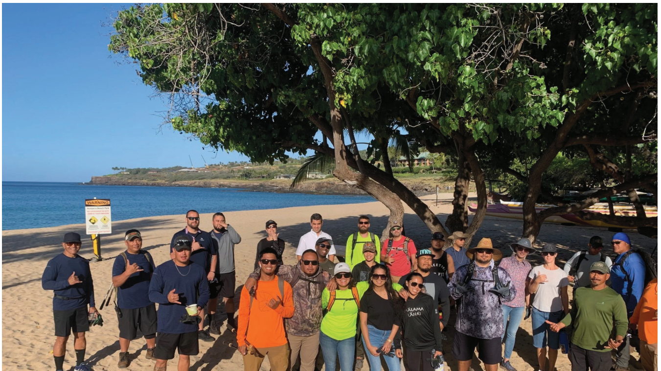
Kapiha'a Interpretive Trail Clean Up 2024