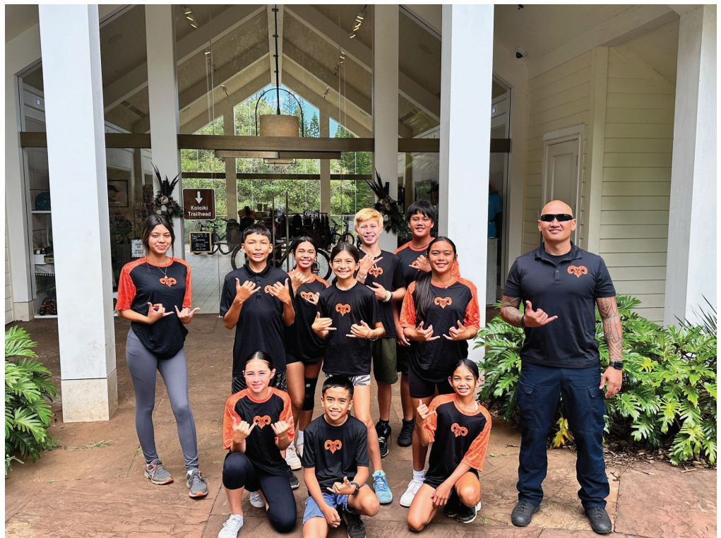
2023 MPD Youth Academy