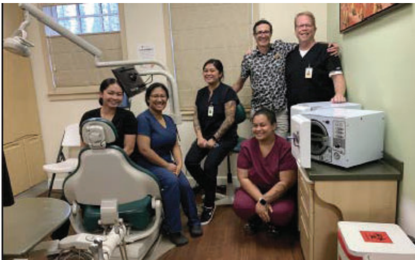
Autoclave donation to LCHC