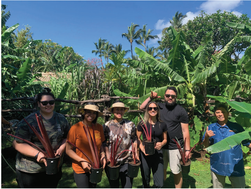
Uluwalu Earth Day 2024