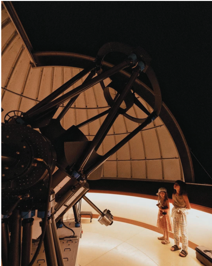
Kilo Hoku Telescope