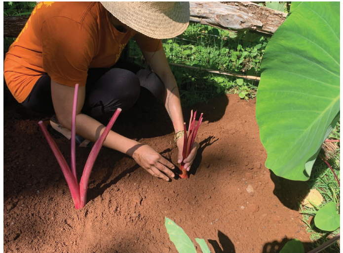
Planting Kalo at Uluwalu on Earth Day 2024