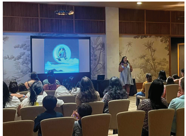
Kilo Hoku Cultural Experience Community Night