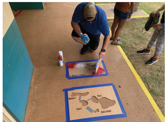
LHES Lokahi Day Volunteer Work