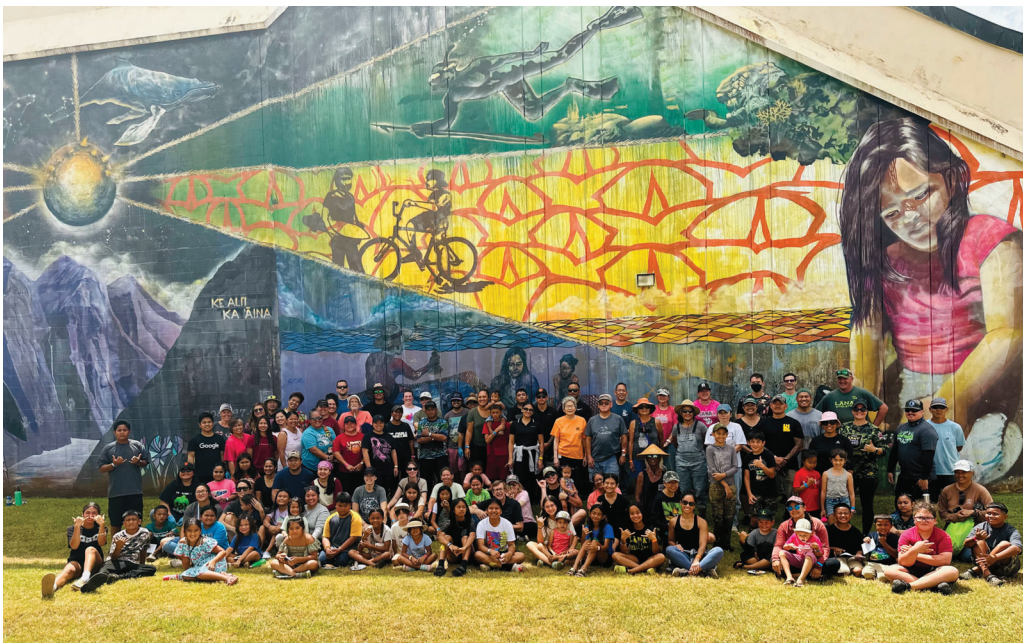
LHES Lokahi Day