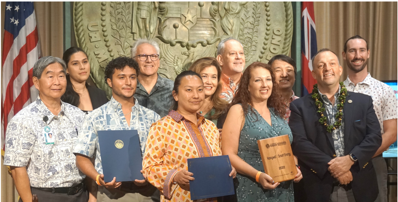
2022 Hawai'i Green Business Awards Ceremony

For more information on the Hawai'i Green Business Program, visit energy.hawaii.gov/green-business-program