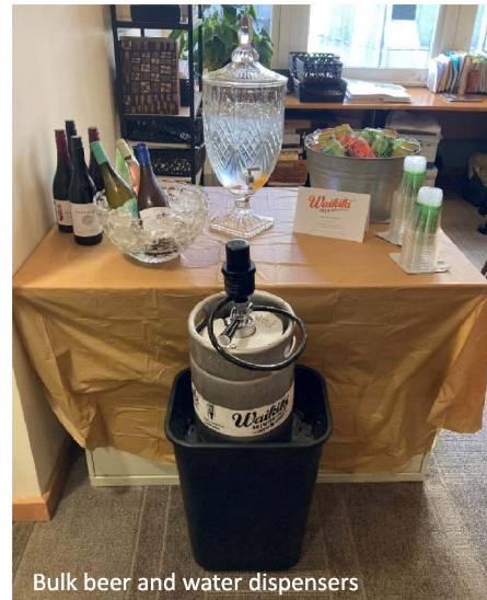
Bulk beer and water dispensers