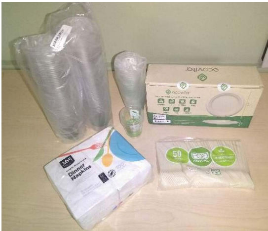
Compostable tableware (1 point).