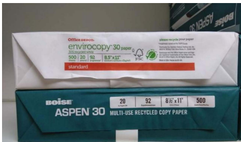
Printing event materials on recycled copy paper (1 point).