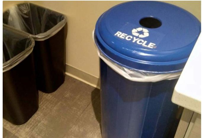
Recycling bin adjacent to trash cans for plastic recycling (2 points).