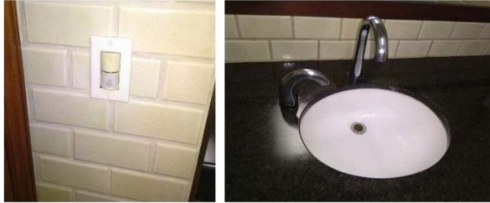
Motion sensor light fixtures and faucet in bathroom (2 points).