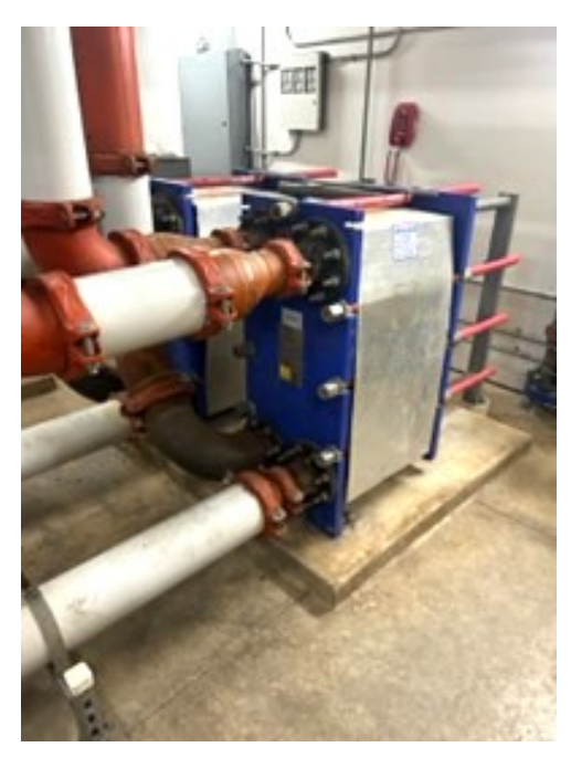
Replaced heat exchanger plates to help reduce energy loss for the condensing water.