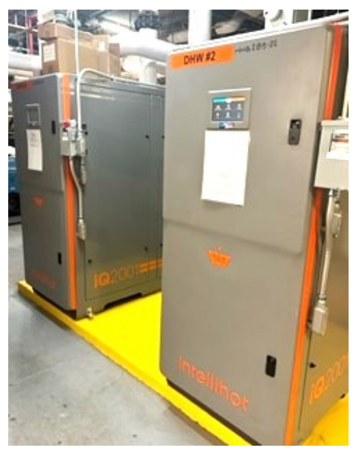
Replaced old hot water heaters with energy efficient on demand hot water heaters.