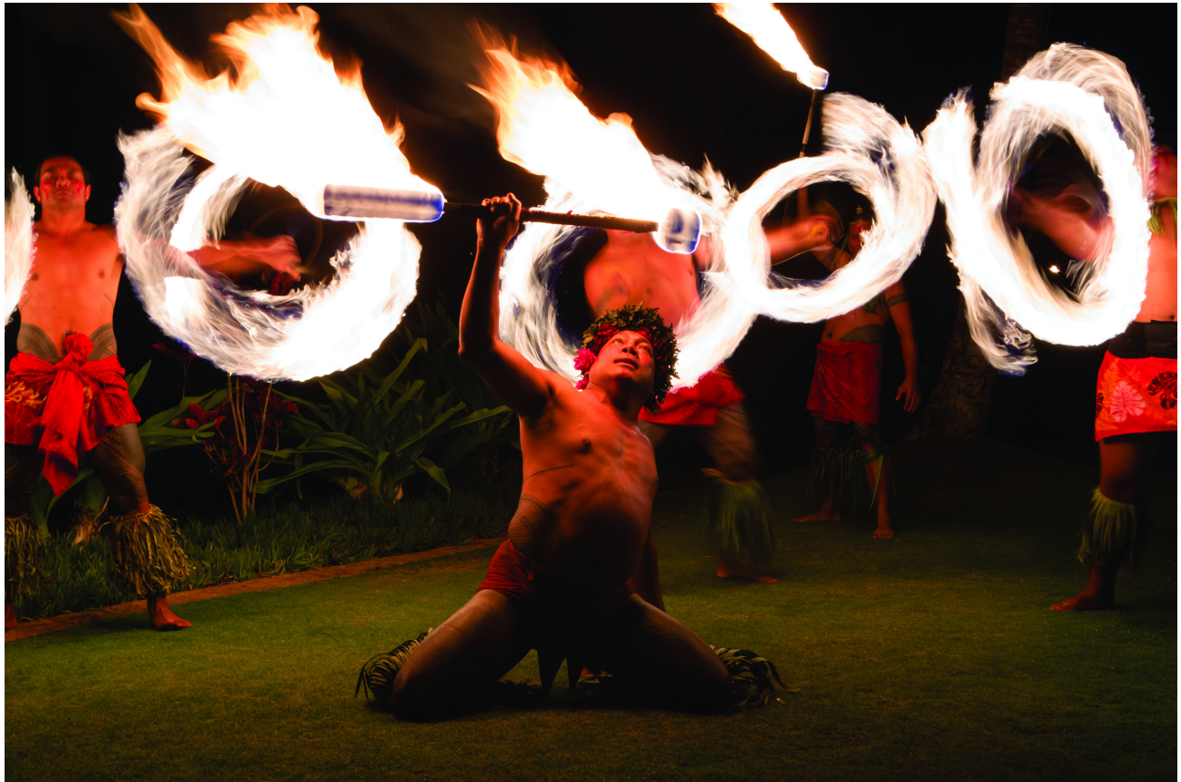
The Samoan-based Fia Fia Luau features Fire Knife Dancing, Hula Dance, and a Hawaiian Feast every Tuesday—taking guests on the journey through the South Pacific. With no show the same, it is always a good look at Polynesian culture.