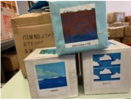
A few of the recycled supplies, stored in 28 storage containers!