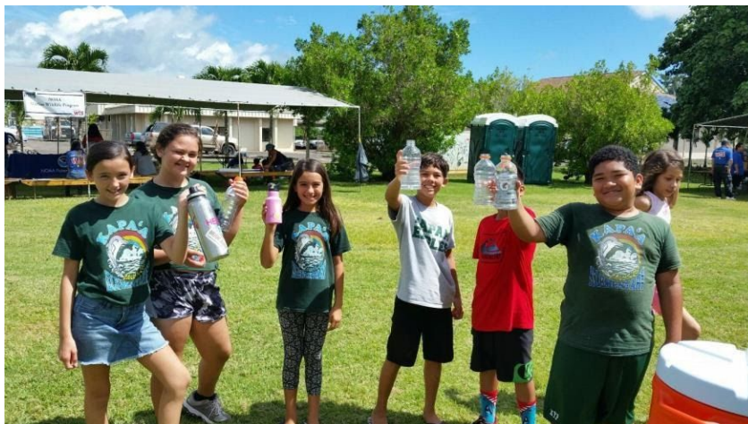
Students show off their reusable water bottles, as they stand in line to refill them at one of the water stations.