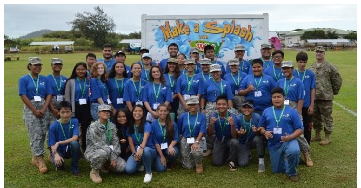
Our awesome JROTC student leader volunteers!