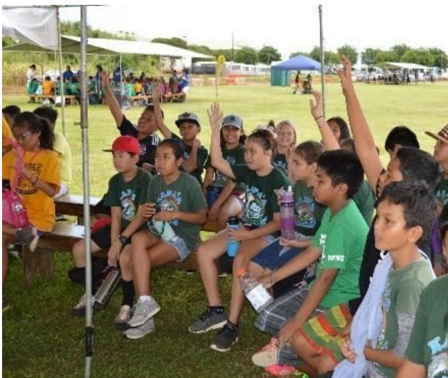
Outdoor classrooms= no electricity