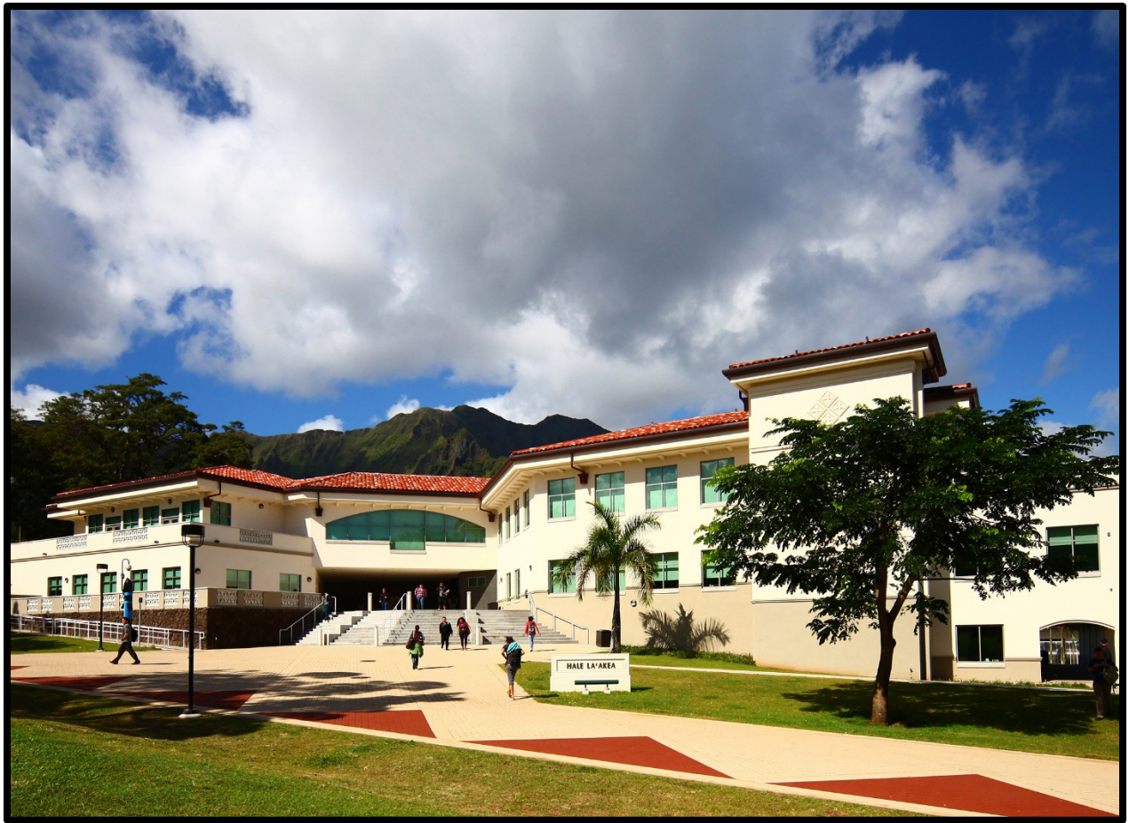
Hale La'akea, WCC's Library is a LEED Silver Building