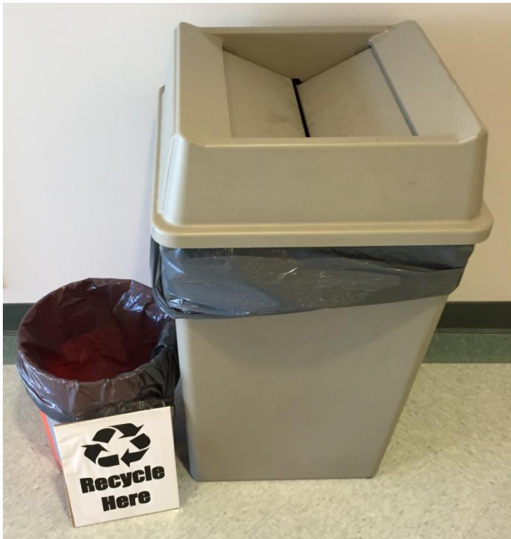
Separate containers for trash and recycling