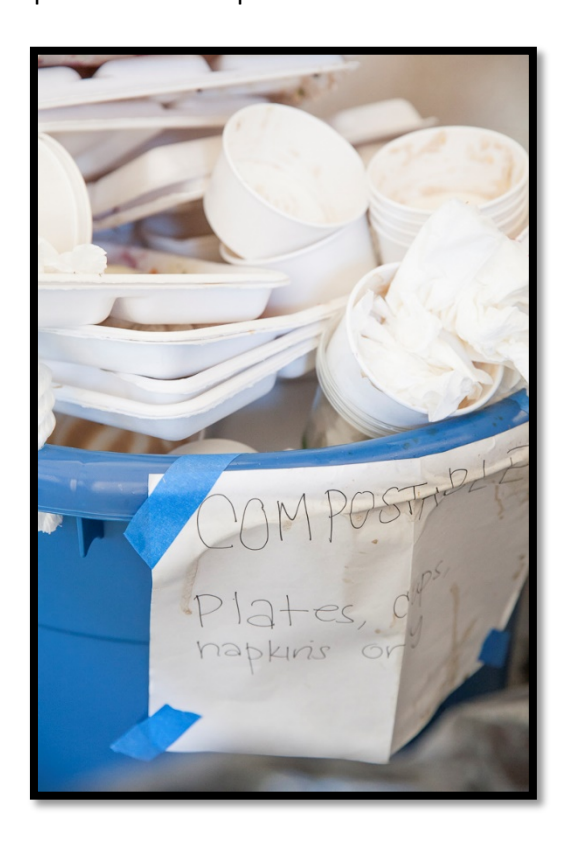
For more information on the event, visit <a href="http://blog.hawaii.edu/sustainabilitysummit/2016-2/2016-keynotes-invited-guests/">http://blog.hawaii.edu/sustainabilitysummit/2016-2/2016-keynotes-invited-guests/</a>

♣ Food waste was separated and composted onsite.