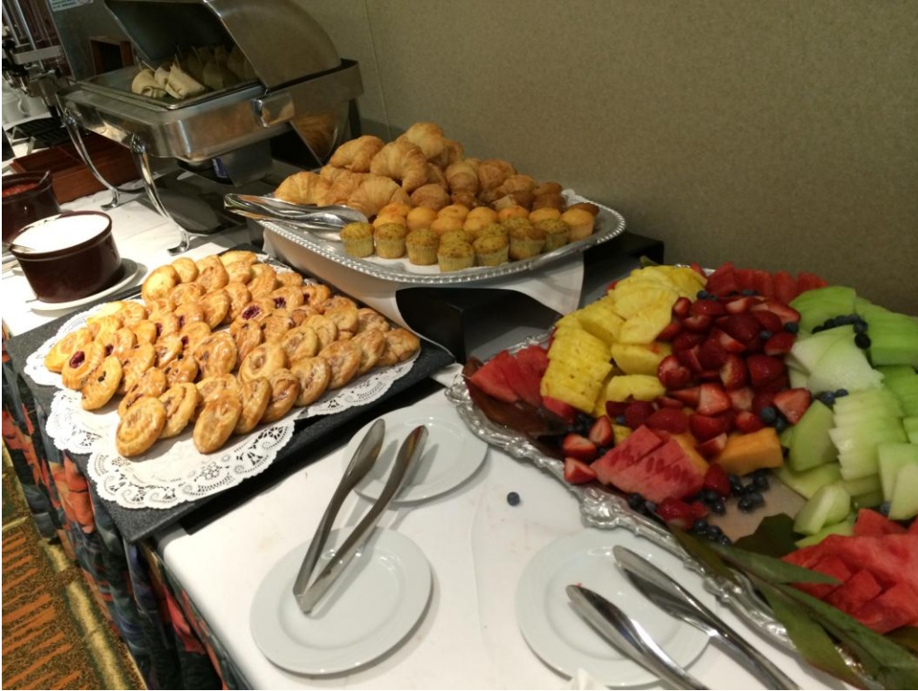
Unwrapped finger food