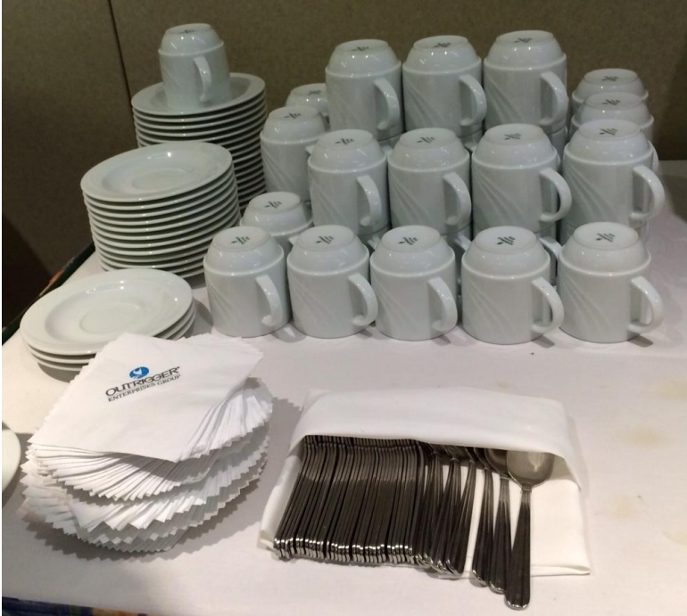
Reusable utensils and cutlery