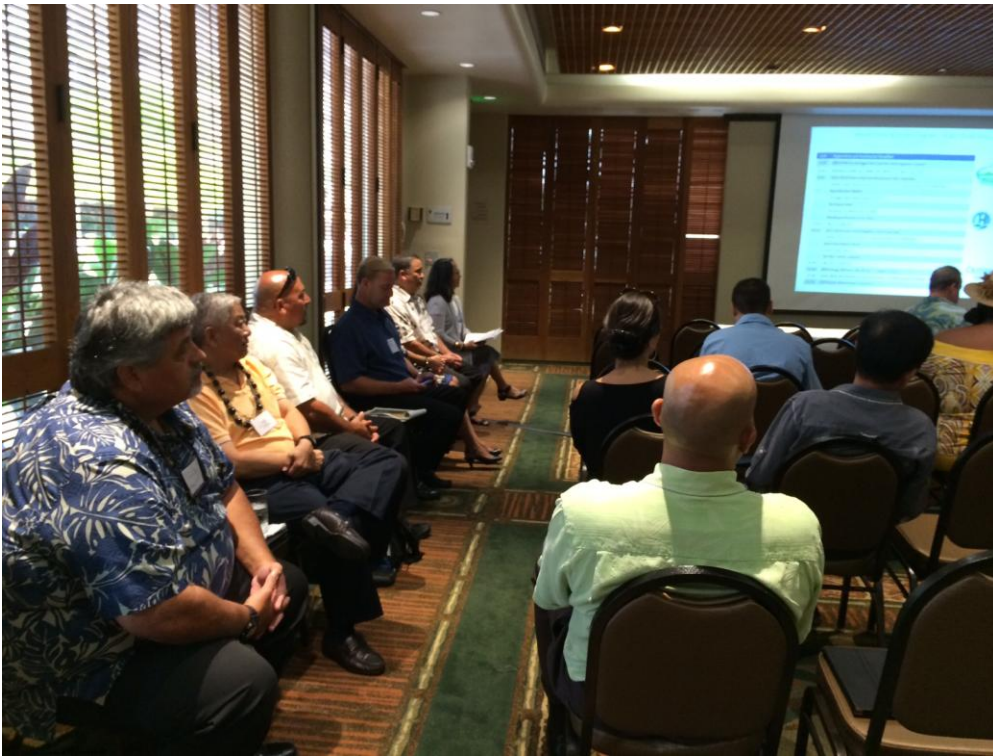
Right venue fit for the number of attendees