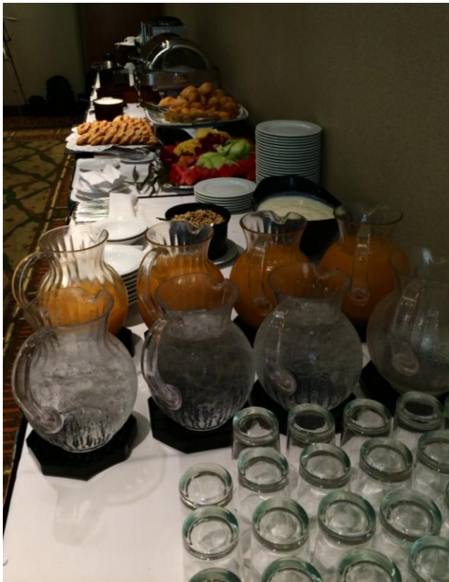
Buffet style meals instead of boxed lunches